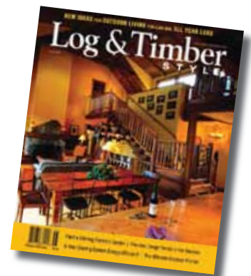
"Twin Lambs Ranch" featured as Mountain Magic