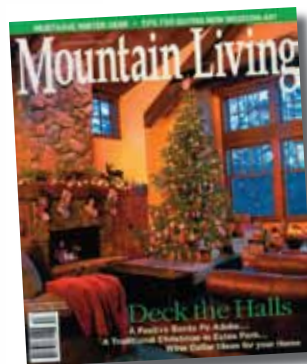
"A Mountain Bungalow" featured as Cover Christmas House