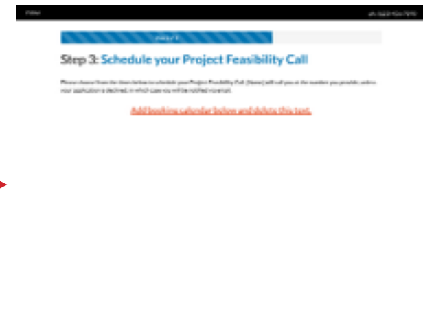
Schedule Call Page