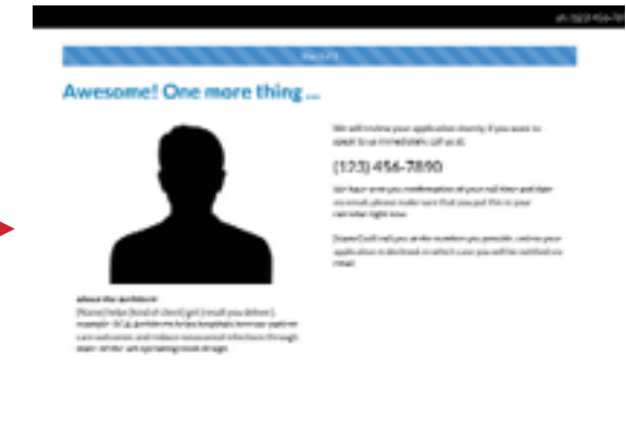
Call Thank You Page