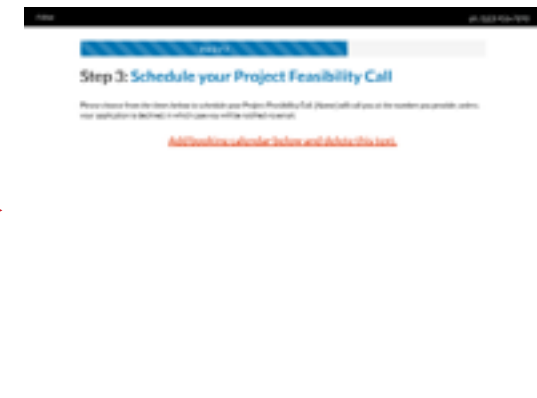
Schedule Call Page