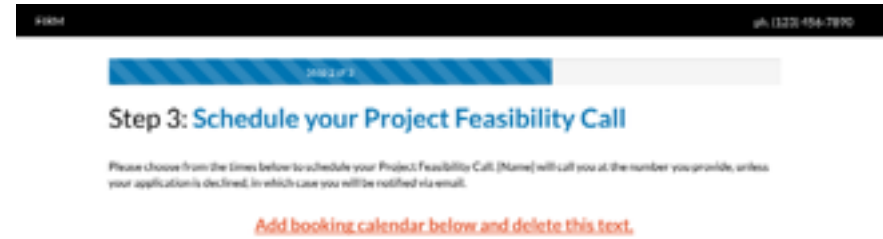
Schedule Call Page